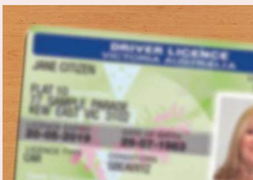
Image is blurred and skewed